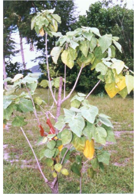
Newly planted rare, native Sida tree at Magens Bay.

Several hurricanes and intermittent droughts destroyed or severely damaged many of the trees along the beachfront and in the mangrove swamp, basin forest and arboretum at Magens Bay on St. Thomas. Magens Bay is internationally famous for its beauty, based in part on its diverse forest and cultural resources. It is one of a very few publicly maintained beaches and the most popular natural recreational attraction on St. Thomas for both residents and visitors. Through a $10,000.00 grant from the V.I. Department of Agriculture's Urban and Community Forestry Assistance Program, administered by V.I. RC&D, the UVI Cooperative Extension Service along with the Magens Bay Authority set out to restore the natural beauty of Magens Bay. This restoration effort, which has been occurring in phases, has progressed from post-hurricane removal of trees, hazardous branches and debris to current replanting efforts to improve the condition of the landscape at Magens Bay for the health of the watershed and for Virgin Islanders to enjoy.