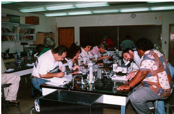
USDA staff examine PHM infested plants.

The pink hibiscus mealybug (PHM) ( maconellicoccus hirsutus , Green) is a serious new threat to U.S. agriculture. This pest, with its heavy, cotton-like, white and waxy covering, attacks more than 200 plant species, including beans, chrysanthemum, citrus, coconut, coffee, cotton, corn, croton, cucumber, grape, guava, hibiscus, peanuts, pumpkin, rose and mulberry. Since it arrived in Grenada in 1994, the PHM has spread to Guyana, and at least 14 other Caribbean islands, including the U.S. Virgin Islands, wreaking havoc with crop production.