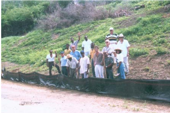
Workshop attendees pose with newly installed silt fence at Estate St. George's Hill, St. Croix.

The V.I. RC&D assisted the UVI Cooperative Extension Service with managing funds and registration for two erosion and sediment control training workshops. Two construction sites -- a shopping center on St. Thomas and a home/farm site on St. Croix -- were seeded (by hand and with a hydroseeder) and covered with mulch matting during the " Practical Approaches for Effective Erosion & Sediment Control Training Workshop ," held May 28-29 and June 1-2, 1998. A silt fence and triangular dike check dam were also installed at the St. Croix demonstration site. Approximately 65