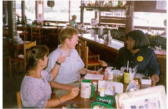
RC&D members and consultants meet with St. Thomas business owner.

The V.I. RC&D and the U.S. Forest Service identified several potential small forest product-based businesses throughout the territory that were in need of information, ideas, resources and contacts to improve their operations. To address and/or assist with forestry-related concerns and problems faced by these small business operators, the V.I. RC&D and USFS brought in two consultants to visit approximately 20 forest-based businesses. A draft report of the trip was submitted to USFS for review and a follow-up project will be implemented to help those small business owners develop their business plans. Project funding: $4,700.00.